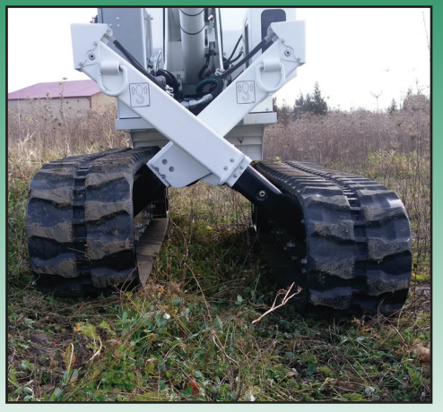
Independently Adjustable Tracks 8" of Vertical Slope Adjustment