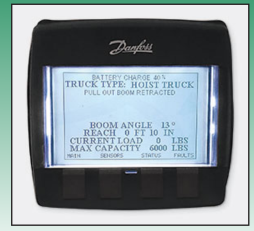
Rated Load Limiter Automatically detects attachment and adjusts loading parameters